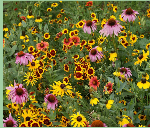
Rocky Mountain Wildflower Mix